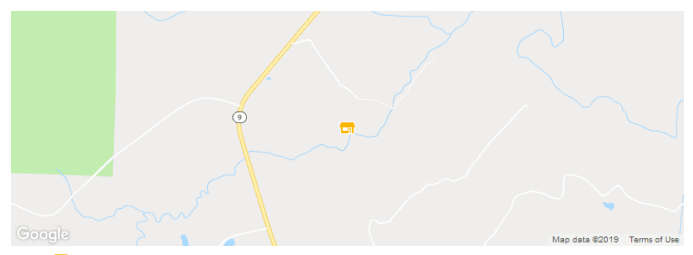
Legend: Subject Property