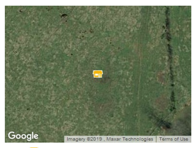
Legend: Subject Property