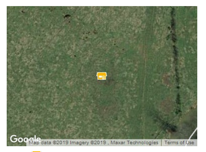
Legend: Subject Property